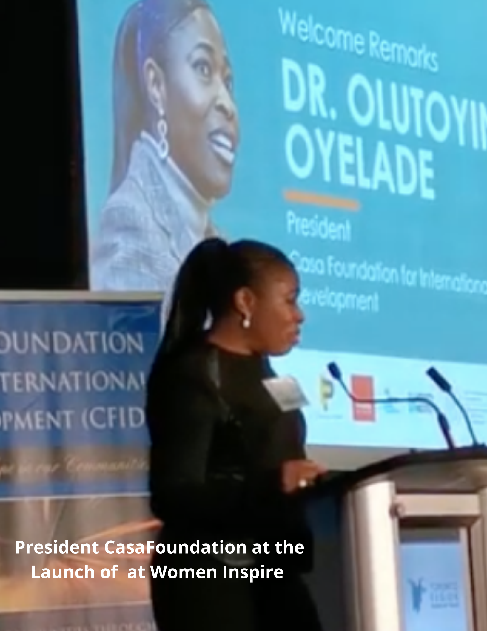
President CasaFoundation at the Launch of at Women Inspire