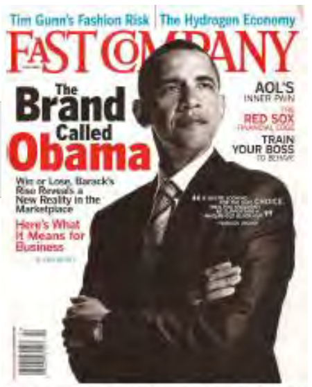
Political Dagge will power by the came

Political campaigns will never be the same!