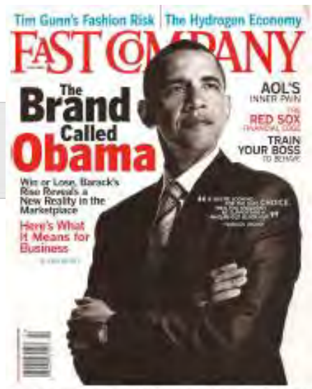
Political Dagge will power by the came

Political campaigns will never be the same!